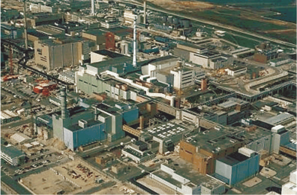
Figure 1. La Hague Plants - Two 800 MTHM/yr plants

France operates a separate facility (MELOX, in southern France) for the manufacture of MOX fuel. MELOX has a nominal capacity of 200 MTHM/yr. In France, MOX fuel is irradiated to a burnup of 42,000 MWD/MTHM; the plan is to increase this burnup to approximately 50,000 (i.e., comparable to \text{UO}_2 fuel). MELOX also produces MOX fuel for overseas customers. France has reprocessed commercial spent MOX fuel through the UP-2 plant (primarily once through but there have been several tests with twice irradiated MOX fuel). France has conducted laboratory tests on americium and curium recycle, and has irradiated several assemblies.