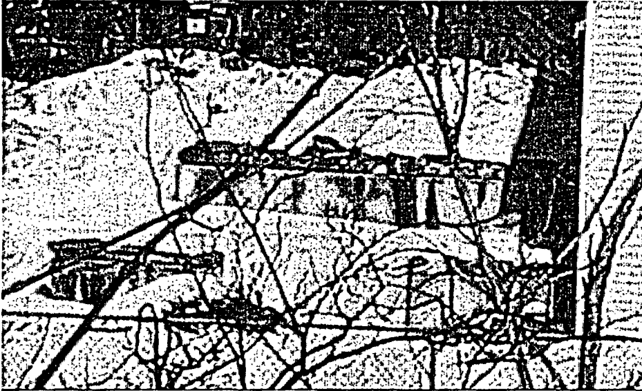
Figure 5 - Closer view of two blocks by side of structure