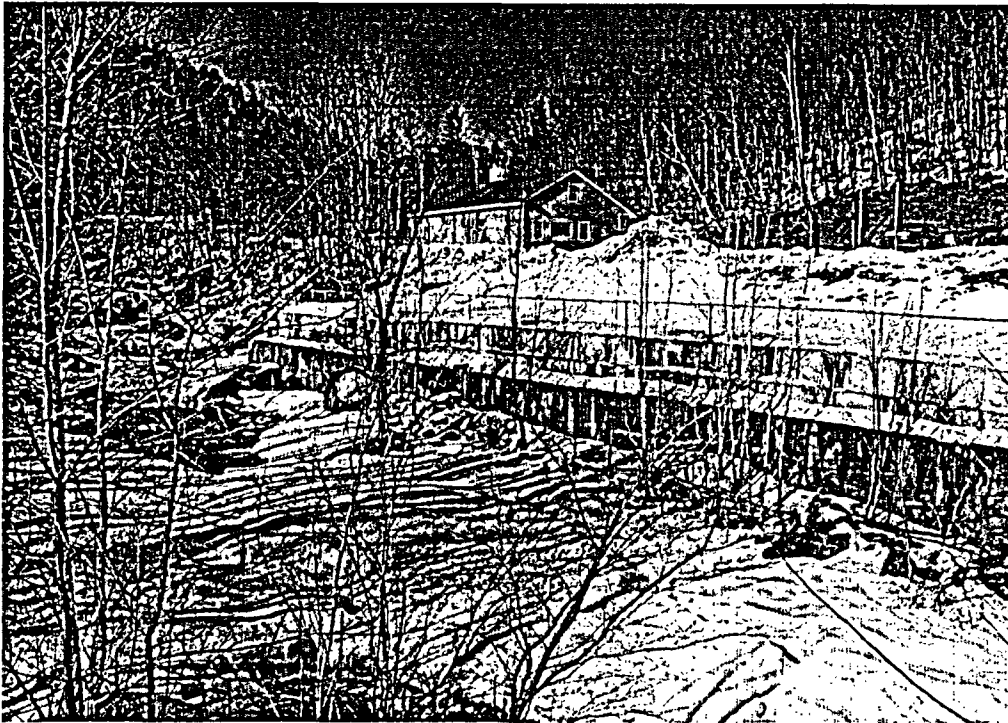
Figure 1 - View of retaining wall