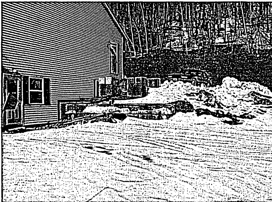
Figure 4 - Single block used at right of structure (lower wall portion)