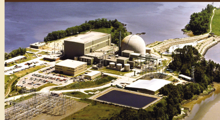
After (Land View)