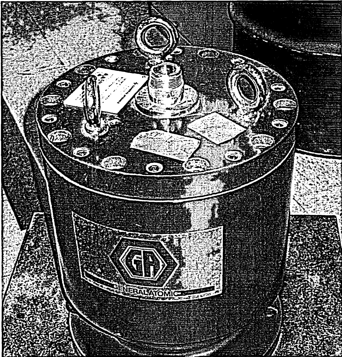
One of GA's Two RG-1's