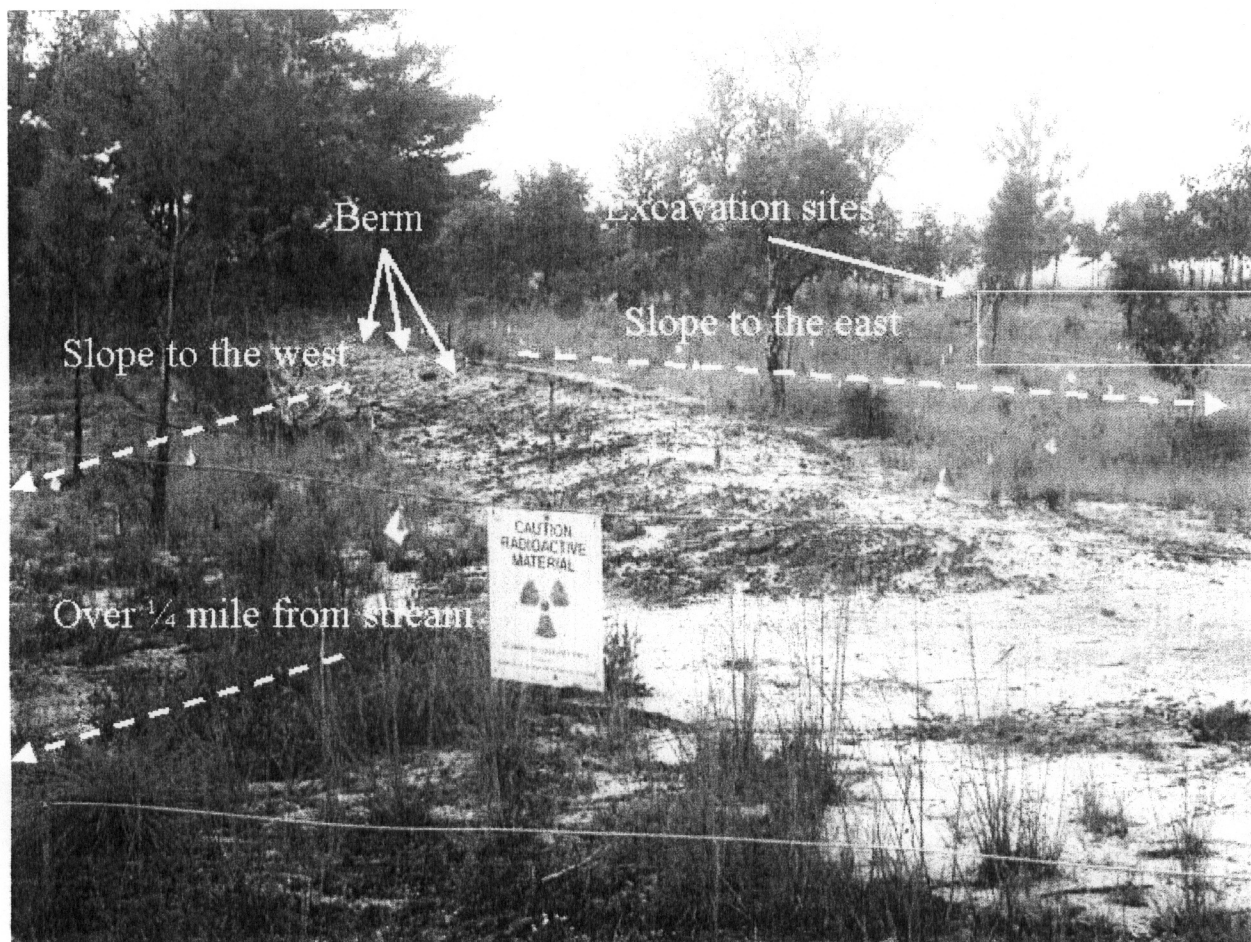
Figure 1. Berm separating excavation site and western slope toward stream.