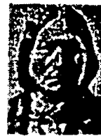
CHIEF BLACK COAL