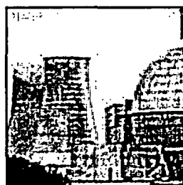
Sellafield: complainant lives in Cumbria where the plant is based

But the ASA ruled the advert was misleading because BNFL "could not predict the effects of the Sellafield nuclear power station on the environment" and ordered the company not to