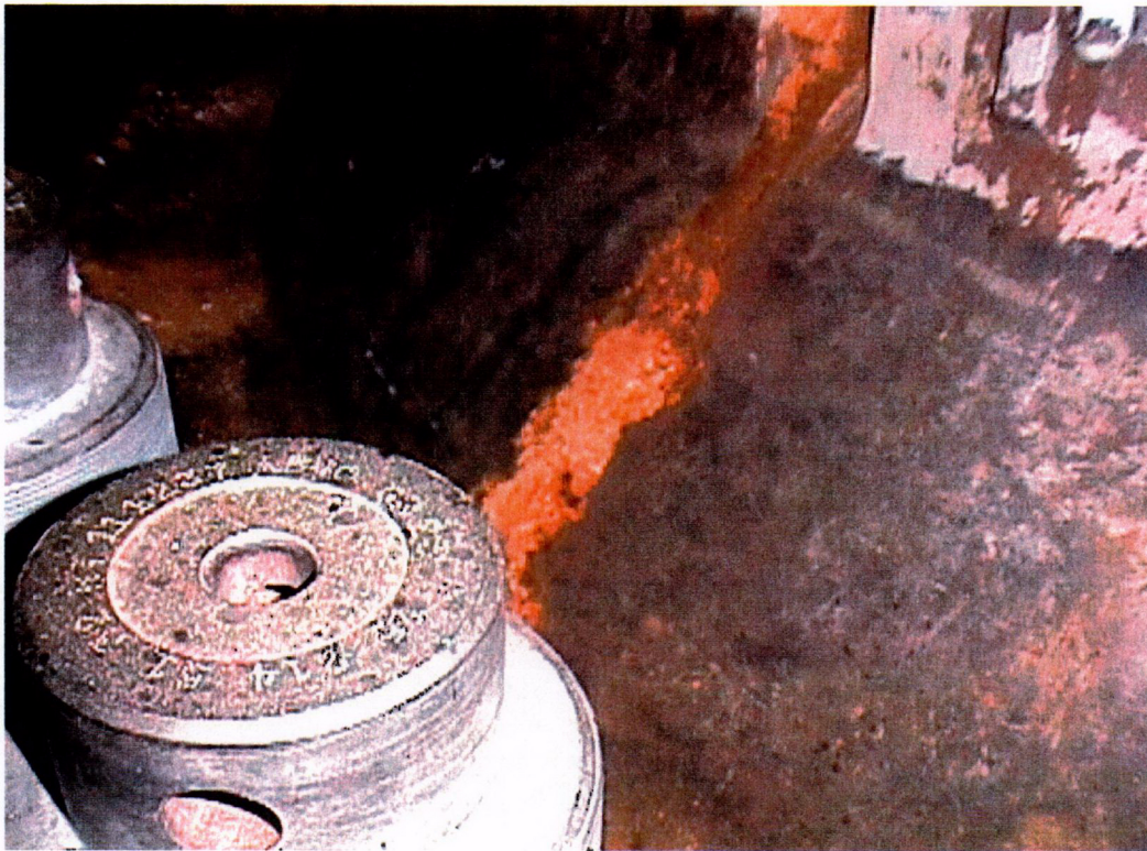
On south side facing west