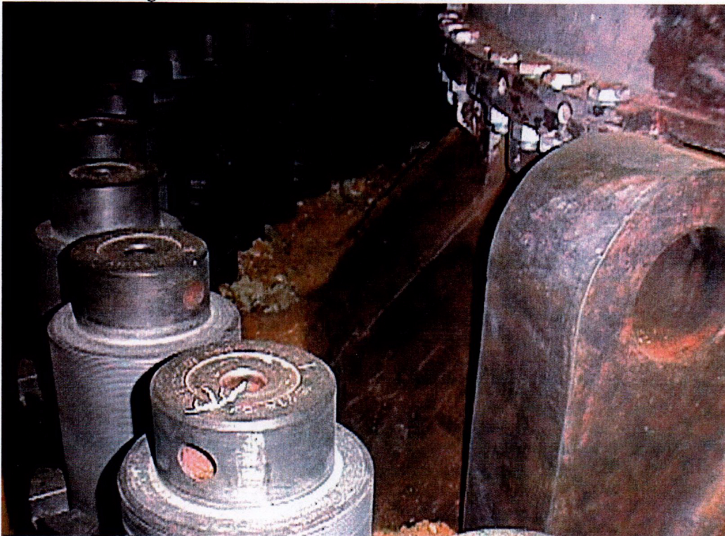
On north side facing south east