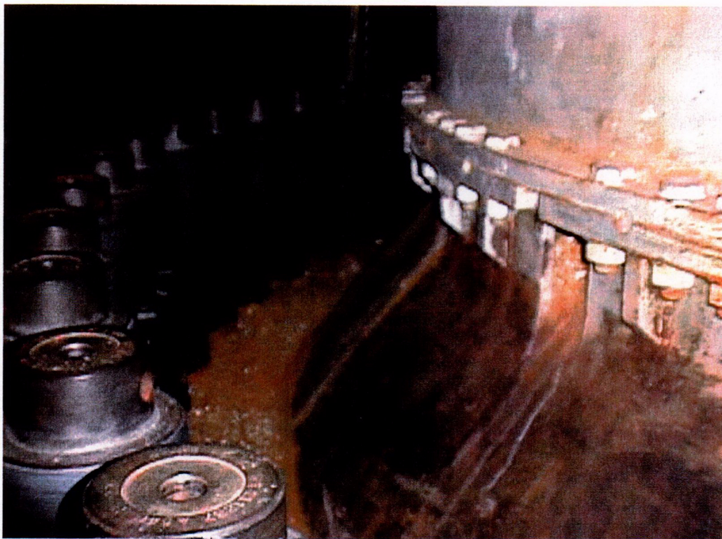
On north side facing east