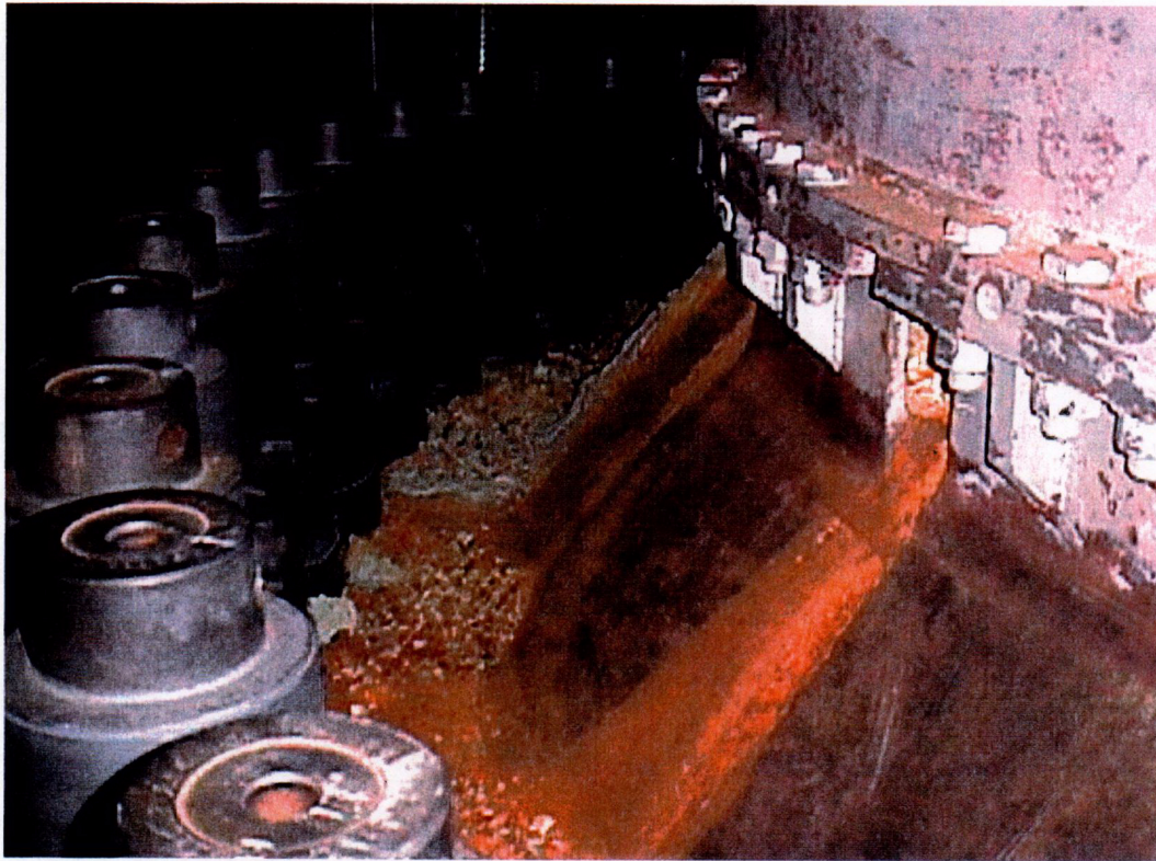
On east side facing south