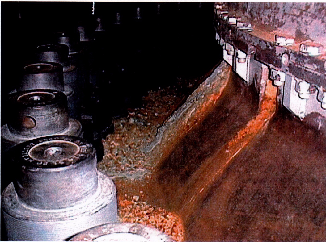
On east side facing south